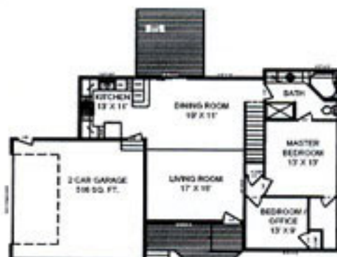
MAIN FLOOR PLAN SCALE: 1/4" = 1'-0"

Blown-in fiberglass insulation R-22 walls R-38 ceilings